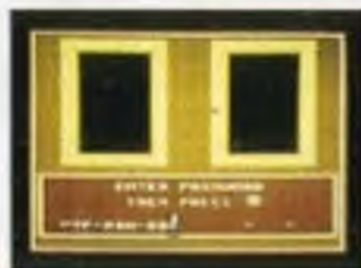
Password Entry Screen